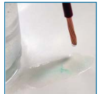
Approx. 40 hours later