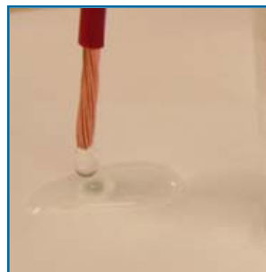
Approx. 24 hours later