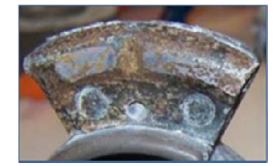
Corroded detent plate and rivets