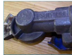
Anodized – Virtually no corrosion on the body

Most standard gladhands with aluminum offer no corrosion protection; these gladhands are not suggested for use in highly corrosive environments. Powder coated gladhands are the next step up for anti-corrosion power, offering substantial corrosion protection. Although they offer great protection, over time the coating will chip away, leaving the area exposed to corrosion. The best form of protection against heavily corrosive environments are anodized gladhands. The images to the right show product in the field after several months.