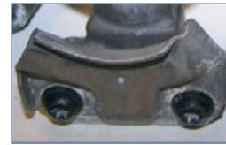
Stainless Steel Connector Plate

As with the gladhand body, there are also several types of connector plates to choose from; gold chromate, cast iron, powder coated steel and stainless steel with powder coating. You will experience the same reaction to corrosion with these as with the body; however there are other things to watch for as well. If the small dimple on the plate wears down, the gladhands will start to lose their ability to seal properly when coupled, allowing air to leak in the system.