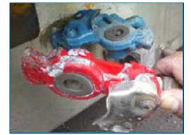
Powder Coated – Corrosion has begun where the coating has chipped