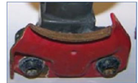
Powder Coated Steel Connector Plate