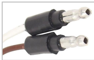
.180 Male Bullet Terminations

There are many types of different connections for lighting but sealed AMP style connections provide the highest level of reliability compared to older .180 bullet terminals, which are unsealed and require periodic greasing, PL-3, or other types of lighting connections on the market.