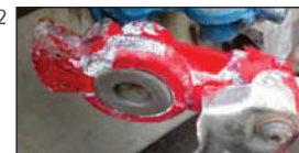
Corrosion is present where powder coating has chipped away