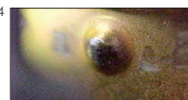
Connector plate dimple