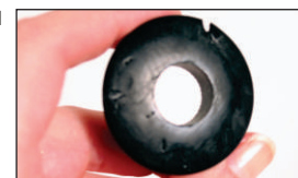
Cracked/worn gladhand seal