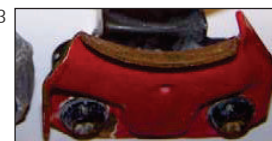
Connector plate with signs of corrosion