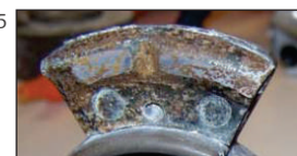
Corroded detent plate